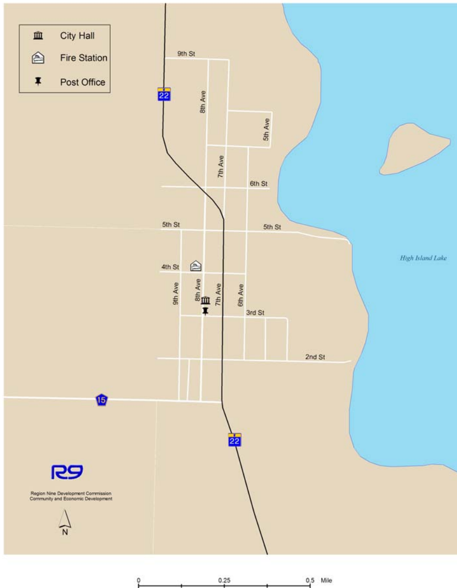
Critical Facilities - City of New Auburn

The City of New Auburn has no police officers, however they do have a law enforcement contract with the County Sheriff’s Department. In the event of a disaster, they have back hoe access, a generator, pump, and fire trucks. (The city would also have access to other equipment although it would not be equipment they own.)