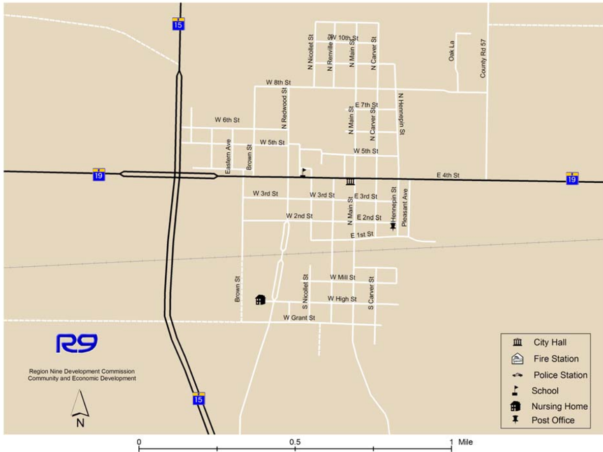
Critical Facilities - City of Winthrop

There are three active police officers in Winthrop. In the event of a disaster, Winthrop has on hand: one pumper, one pumper/tanker, one tanker, one grass rig, one rescue van, one payloader, three dump trucks, and one grader.